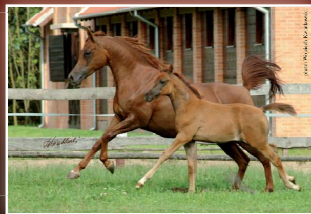
Granada with Gaja Selene